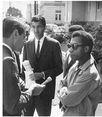
Howard Zinn, James Baldwin, and a journalist on Freedom Day in Selma, Alabama, October, 1963.

Born in Harlem, Baldwin was a “witness to the truth” about racism and homophobia through his novels, plays, essays, and poetry including Go Tell It on the Mountain (1953), Notes of a Native Son (1955), Giovanni’s Room (1956), Nobody Knows My Name (1961), Another Country (1962), The Fire Next Time (1963), If Beale Street Could Talk (1974), and The Evidence of Things Not Seen (1985). Baldwin was active as a writer, speaker, and ally of the southern Civil Rights Movement. He participated in the 1963 March on Washington for Jobs and Freedom, Freedom Day in Selma in 1963 , and the 1965 Selma to Montgomery March.