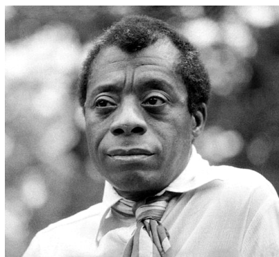
James Baldwin, 1969.

Let's begin by saying that we are living through a very dangerous time. Everyone in this room is in one way or another aware of that. We are in a revolutionary situation, no matter how unpopular that word has become in this country. The society in which we live is desperately menaced, not by Khrushchev, but from within. To any citizen of this country who figures himself as responsible — and particularly those of you who deal with the minds and hearts of young people — must be prepared to “go for broke.” Or to put it another way, you must understand that in the attempt to correct so many generations of bad faith and cruelty, when it is operating not only in the classroom but in society, you will meet the most fantastic, the most brutal, and the most determined resistance. There is no point in pretending that this won't happen.